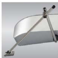
■ Articulated Pushing Arm