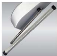
■ On Sliding Arm