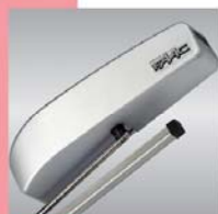
■ 950 BM operator Housing in plastic

This product is not just attractive, but is also sturdy, reliable and, above all, safe. In compliance with current safety regulations, speed and force are programmed according to the door's dimensions. If the door meets an obstacle, it re-opens immediately and, when it closes the next time, it verifies clearance of the obstacle at slow speed.