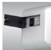
■ Functions selector Switch