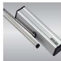
■ Housing in anodised aluminium